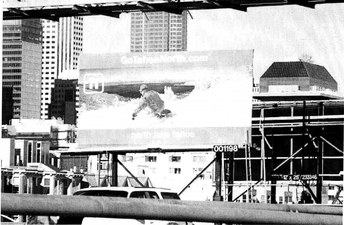
Bay Bridge Outdoor Billboard